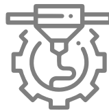
Industry Banking and financial services