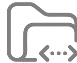
Use cases Publicly available information and Everest Group resources