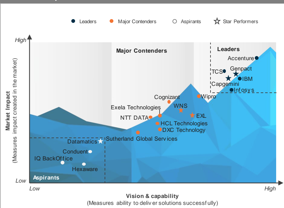
Everest Group PEAK Matrix™ for F&A DCP 2020 1,2